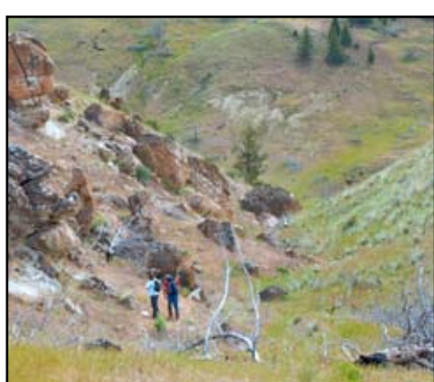
Out on the course