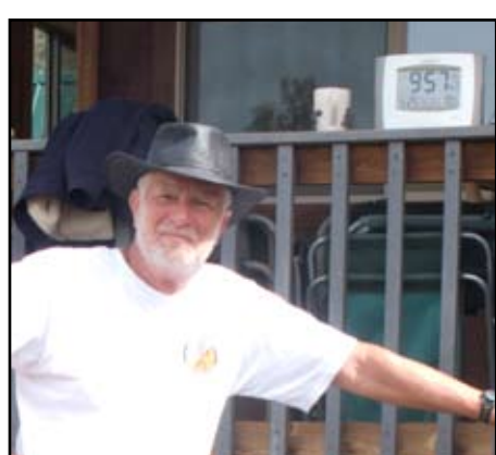
Mal before the start

Contact Virginia (e-mail at bottom) if you lost a watch or "Buff."